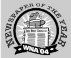
Wisconsin Newspaper Association Newspaper of the Year 2004

Company Links Gannett Co., Inc. USAToday.com USAWeekend.com Gannett Foundation